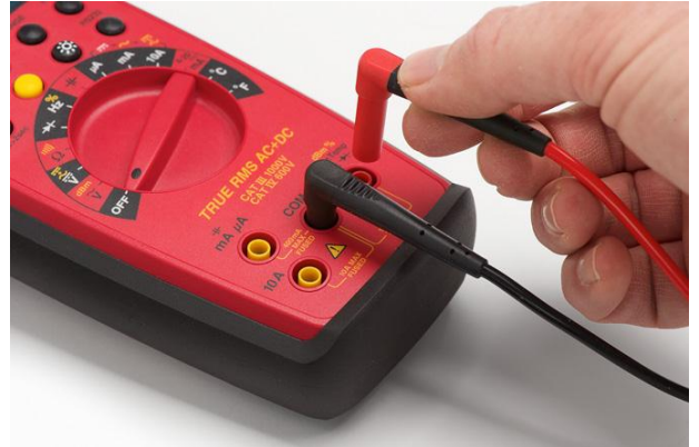
Universal plugs compatible with all 4mm shrouded inputs