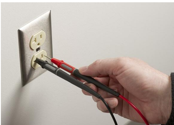
Increased tip exposure for CAT II probing