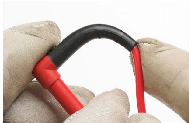
Extreme strain relief tested to withstand over 30,000 bends