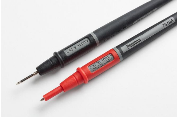
Probes always show the correct category rating for the tip exposure being used