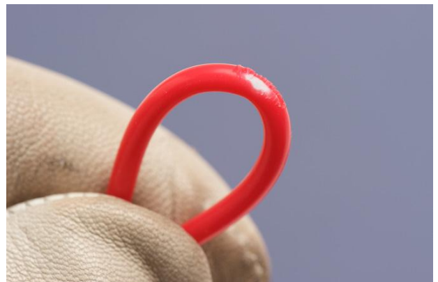
WearGuard™ indicator shows insulation damage

USA: Sales: 800-490-2361 Technical Support: technicalsupport@pomonatest.com Fax: 425-446-5844 Europe: 31-(0) 40 2675 150 International: 425-446-5500 Where to Buy: www.pomonaelectronics.com